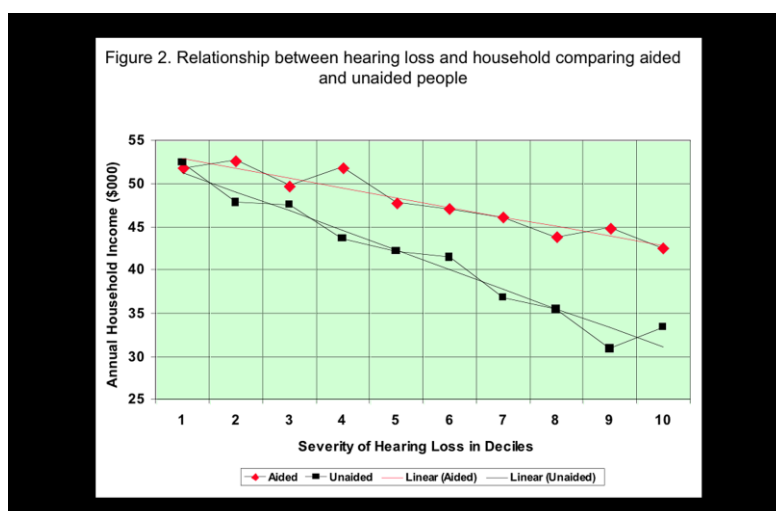
Figure 12.1. Relationship between household income and severity of hearing loss for hearing aid users and non-users (Kochkin, 2007a).

for hearing aid users and non-users across the 10 deciles of hearing loss from 1 (mild) to 10 (profound), compared with households with no hearing loss.